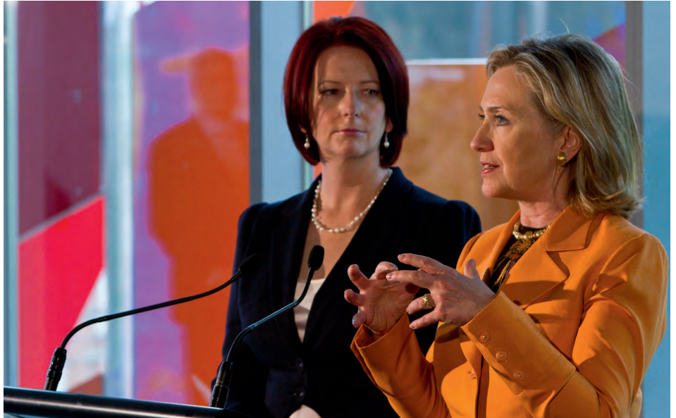
The Prime Minister of Australia, the Hon Julia Gillard and U.S. Secretary of State, Hillary Clinton at a press conference at Australia's first carbon neutral office building, the Pixel Building in Melbourne.