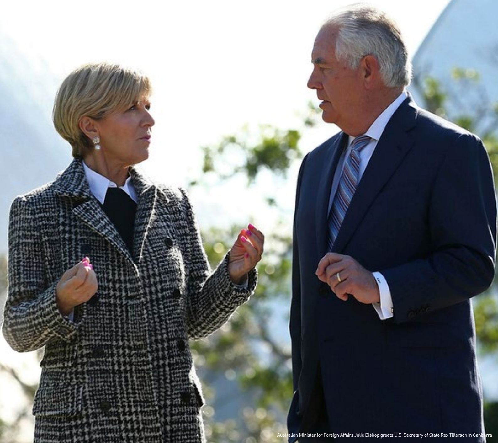
Australian Minister for Foreign Affairs Julie Bishop greets U.S. Secretary of State Rex Tillerson in Canberra

in Australia-United States Alliance Studies