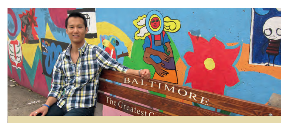
I love these benches (pictured) scattered throughout Baltimore. It's not because of their bold and perceptibly ironic message, but because this sentiment really resonates with my impression of this city. Crime and poverty are endemic in Baltimore. However, this city is also filled with thousands of talented individuals dedicated to improving the wellbeing of Baltimoreans, as well as humanity. Indeed, my host school's tagline is 'Saving lives, millions at a time'. It is this optimism and enthusiasm that I choose to embrace during my stay in this East Coast city.

I enjoy working in an environment that fosters a style of thinking different to that which typically occurs in the MND research community. There have also been many opportunities to network with experts within and outside my field of work. I have attended the International Congress for Neuroinformatics in Boston, which was essentially a crash course in research strategies not familiar to most MND scientists. Before the end of the year I will also be attending a meeting for the American ALS clinical trials consortium in Florida, and the largest neuroscience conference in the world in Washington, DC.