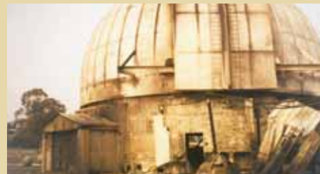
Mt Stromlo's fire-destroyed 74-inch telescope, 2003

Dan came to Australia in 1996, and later returned to Australia as a science journalist. In the April issue of Natural History Magazine, Dan wrote a feature article on wildfires, drought and climate change in Australia following the devastation of the 2003 Canberra fires. The article highlighted the extremities of climate change with 'high intensity blazes with temperatures exceeding 1,800 degrees [Fahrenheit - hot enough] to melt copper'. The article included photographs of Mt Stromlo's 74-inch telescope which was destroyed by the fire.