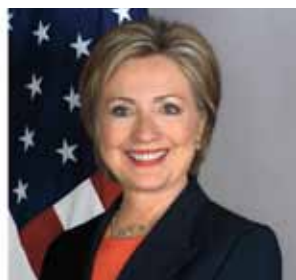
Hillary Clinton, Secretary of State, United State of America