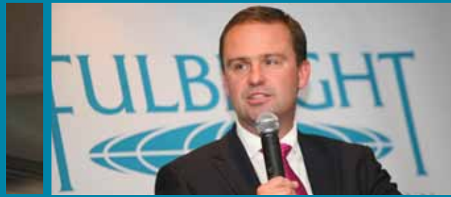
The Premier the Hon David Bartlett addresses the dinner guests.