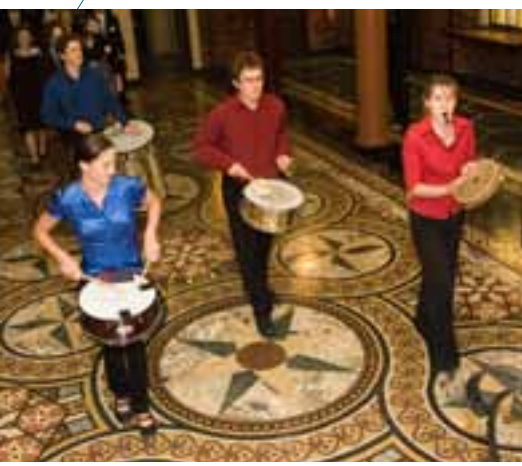
Defying Gravity leads guests into Winthrop Hall, UWA