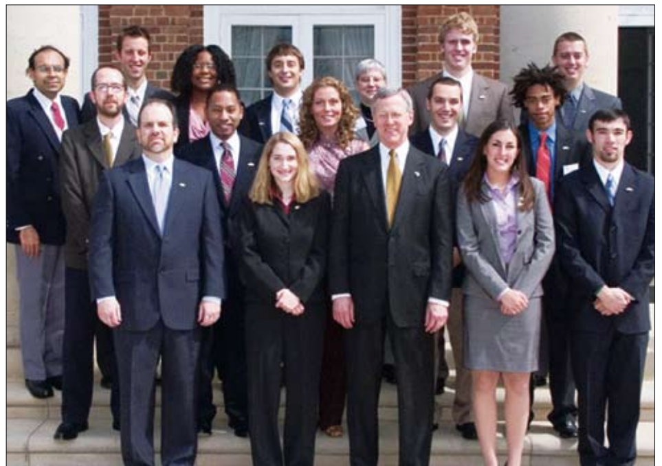
2006 U.S. Fulbright Scholars with the new U.S. Ambassador, Robert D. McCallum, Jr. (centre front).

“The discussions, both formal and informal, were beneficial on a personal and professional level,” commented Scholars.