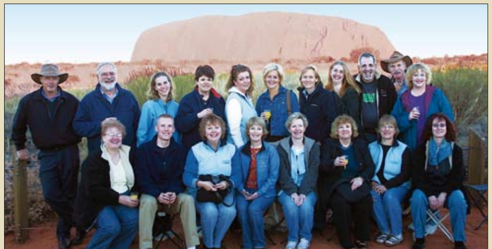
2006 Fulbright-Hays participants at Uluru on 4 th July.

Participants' projects are available on the Fulbright website: www.fulbright.com.au