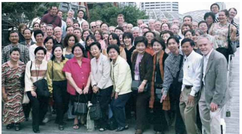
Conference delegates in Sydney for the Fulbright East Asia Pacific Regional Conference

The conference was a productive professional and social exchange that will continue to build the strength of the Fulbright Program in the East Asia Pacific region.