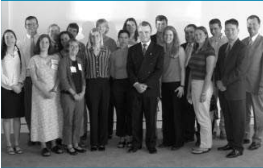
The Hon. Dr Brendan Nelson MP Minister for Education, Science and Training (centre front) with the 2002 U.S. Fulbright Award recipients at the Parliament House reception hosted by Dr Nelson during the February Enrichment Seminar.