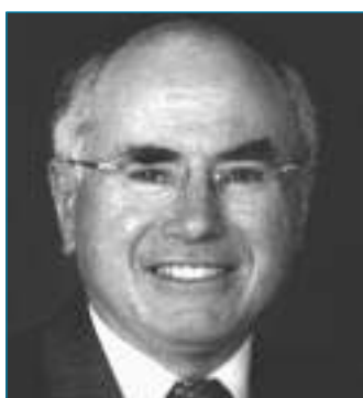
The Hon John Howard, MP

The Mission of the Fulbright Commission is to further mutual understanding between the peoples of Australia and the United States through educational and cultural exchange. This is primarily achieved through the administering of Fulbright scholarships to support research and study of Australians in the United States and Americans in Australia each year. The Fulbright Commission also provides educational advising services and assistance to Australian institutions and individuals interested in study or institutional linkages in the United States.