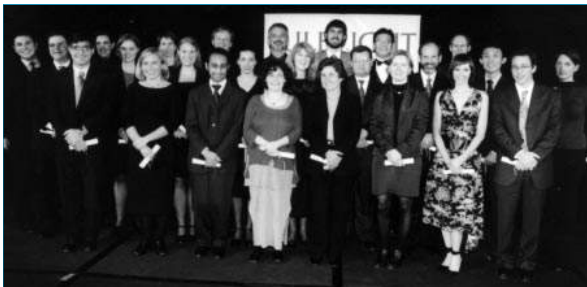
The 2002 Australian Fulbright Award recipients at the National Awards Dinner, Parliament House, Canberra

State Secretaries also combined the National Dinner with their annual Seminar in Canberra. Their commitment and support in coordinating the regional selection process for the Postgraduate Student and Postdoctoral Fellow Awards is greatly appreciated.