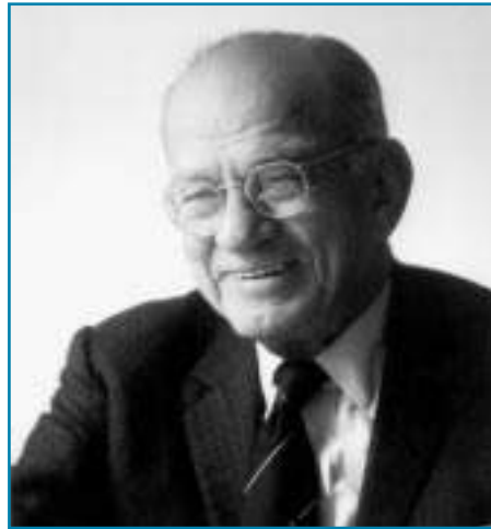
James William Fulbright

In November 1944 he was elected to the U.S. Senate and served there from 1945 through 1974 becoming one of the most influential and best-known members of the Senate. His legislation, which established the Fulbright Program, passed through the Senate in 1946 funded by war reparations and foreign loan repayments to the